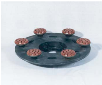
17" Diamond Driver 17" round spike plate that accommodates polishing and scrubbing.