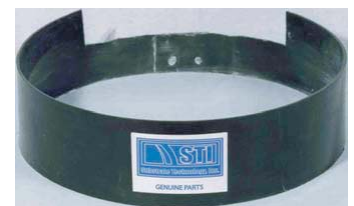
Splash Guard 18" round splash guard fits around Diamond Disc Driver.